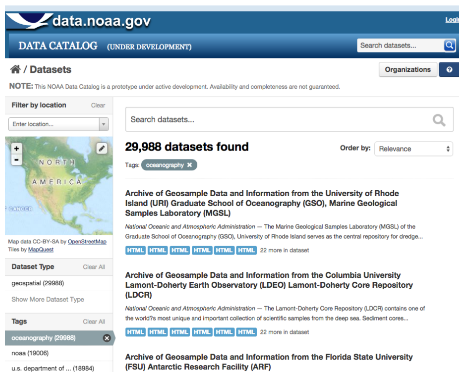
Figure 2: Oceanography Data Sets on NOAA's Data Portal

FTP site,” helped reinforce the perception of NOAA as an open data innovator, both externally and within internal culture. 22